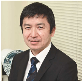
Ph.D. / Professor

Weight bearing index , Speed of sound , Gait speed , Physical function