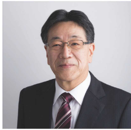
Doctor of Science / Professor

Shape memory materials, steel materials, magnetic materials(magnets),super conducting materials, microstructure control, physical properties of structural functions,electron theory,first principles calculation