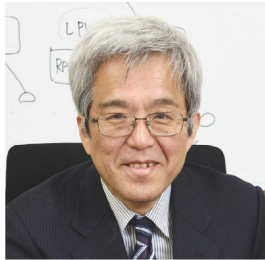
Ph.D.(Information Science) / Professor

IoT, Internet of Things, Edge Computing, Cloud Computing, Energy Management, Mobility System, IoT Education, Prototyping