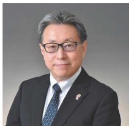
Ph.D. Eng. / Professor

Multimedia Processing, Artificial Intelligence, Trusted Communication, Machine Learning