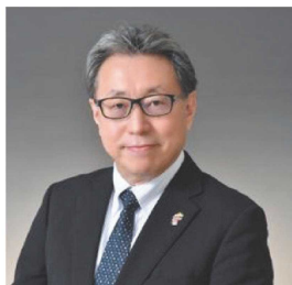
Ph.D. Eng. / Professor

Multimedia Processing, Artificial Intelligence, Trusted Communication, Machine Learning