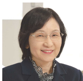
Ph.D. / Professor

Food safety, aflatoxin, biosynthesis, detection method of aflatoxigenic fungi, microorganisms, secondary metabolism