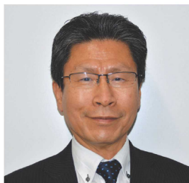
Doctor of Engineering / Professor