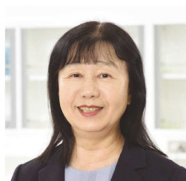
Doctor of Pharmacology / Professor

Protein science, molecular biology, crop, environmental stress