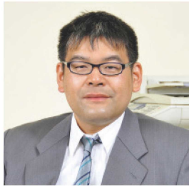
Doctor of Engineering / Associate Professor