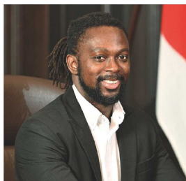
Communication Studies M.A. / PMP / Assistant Professor