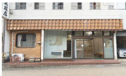
Image 1: View of the exhibition hall (Imadate district, Echizen City, Fukui Prefecture)

In creating a work of art on this theme, I select a specific region or place and visit it many times to gain insight into the local climate, topography, climate, history, art and culture, lifestyle, activities, and people. and I do drawings and sketches in specific areas to get inspiration for my art work. It then identifies buildings, structures, or wall surfaces that have an inherent local history (space and time). I will use locally produced Japanese paper to copy the surface of the wall. I use this washi paper to create works of art using a technique called installation. I am continuing my research by creating and presenting such works.