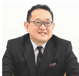
Ph.D. / Professor