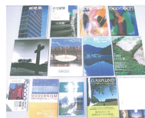
Fig.3 Books and Articles written by Y.Kawashima

Y. Kawashima (text), Y. Yoshimura (photo), E.G.Asplund, TOTO Shuppan (2005), worldwide released by En/Jp bilingual text