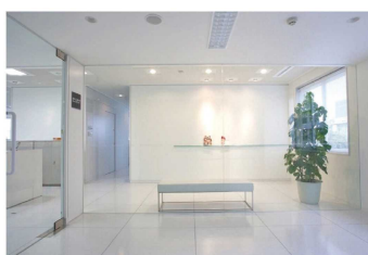
Fig.2 Y.Kawashima, Career Center FUT, 2011