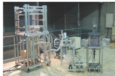
Fig.1 Developed cerium oxide recovery device

By utilizing this phenomenon, when a plurality of particles is mixed, different floating positions can be obtained by suspending in a paramagnetic liquid and applying a magnetic field. In this way, a plurality of mixtures can be separated and collected at the same time. Also, in the case of a substance that floats, if a magnetic field is applied from above, it will be possible to settle at different positions. Further application of a magnetic field from the lateral direction makes it possible to transport suspended particles (without macroscopic fluid movement). Utilizing this phenomenon, we have developed a device for recovering rare earths. (Fig. 1)