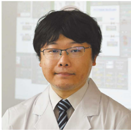
Doctor of Engineering / Senior Lecturer

Small modular reactor, SMR, Advanced reactor, Nuclear thermal application, Industrial and regional affinity