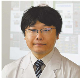
Doctor of Engineering / Senior Lecturer

Small modular reactor, SMR, Advanced reactor, Nuclear thermal application, Industrial and regional affinity