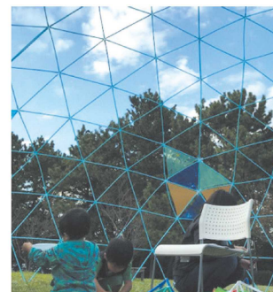
photo.3 Strodome with a diameter of 5 m