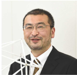
Doctor of Engineering / Associate Professor

Architecture, architect, design, workshop, renovation