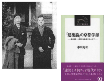
Fig.2 T.Masuda and K.Morita : Architecture of Kyoto-School