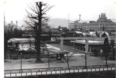
Fig.3 Architect T.Igarashi and Fukui-jinja-Shrine